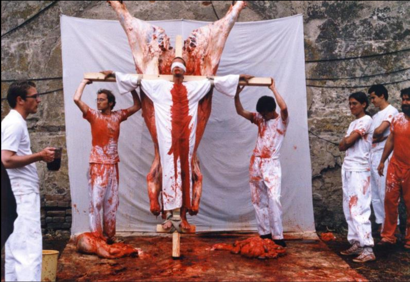
Hermann Nitsch, The Orgien Mystery Theaters , Prinzenhof 1984