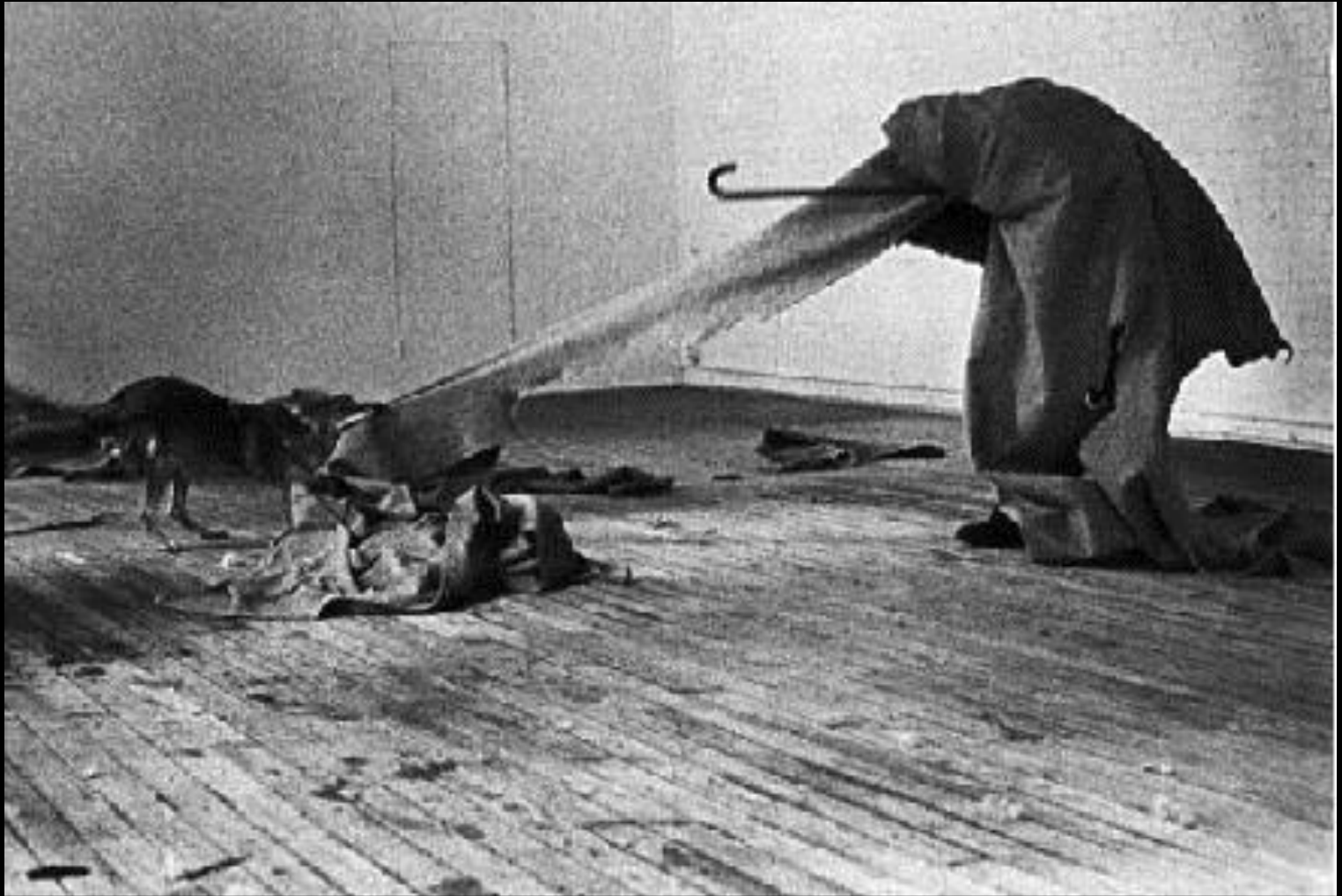
Joseph Beuys, I Like America and America likes Me , 1974