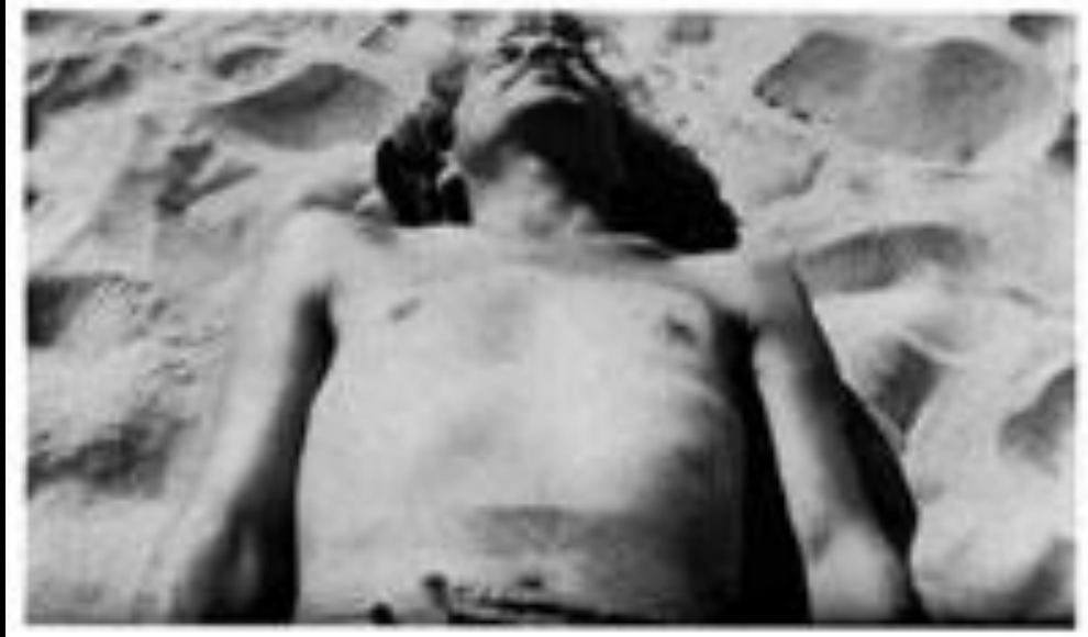
Dennis Oppenheim, Tactis , 1970