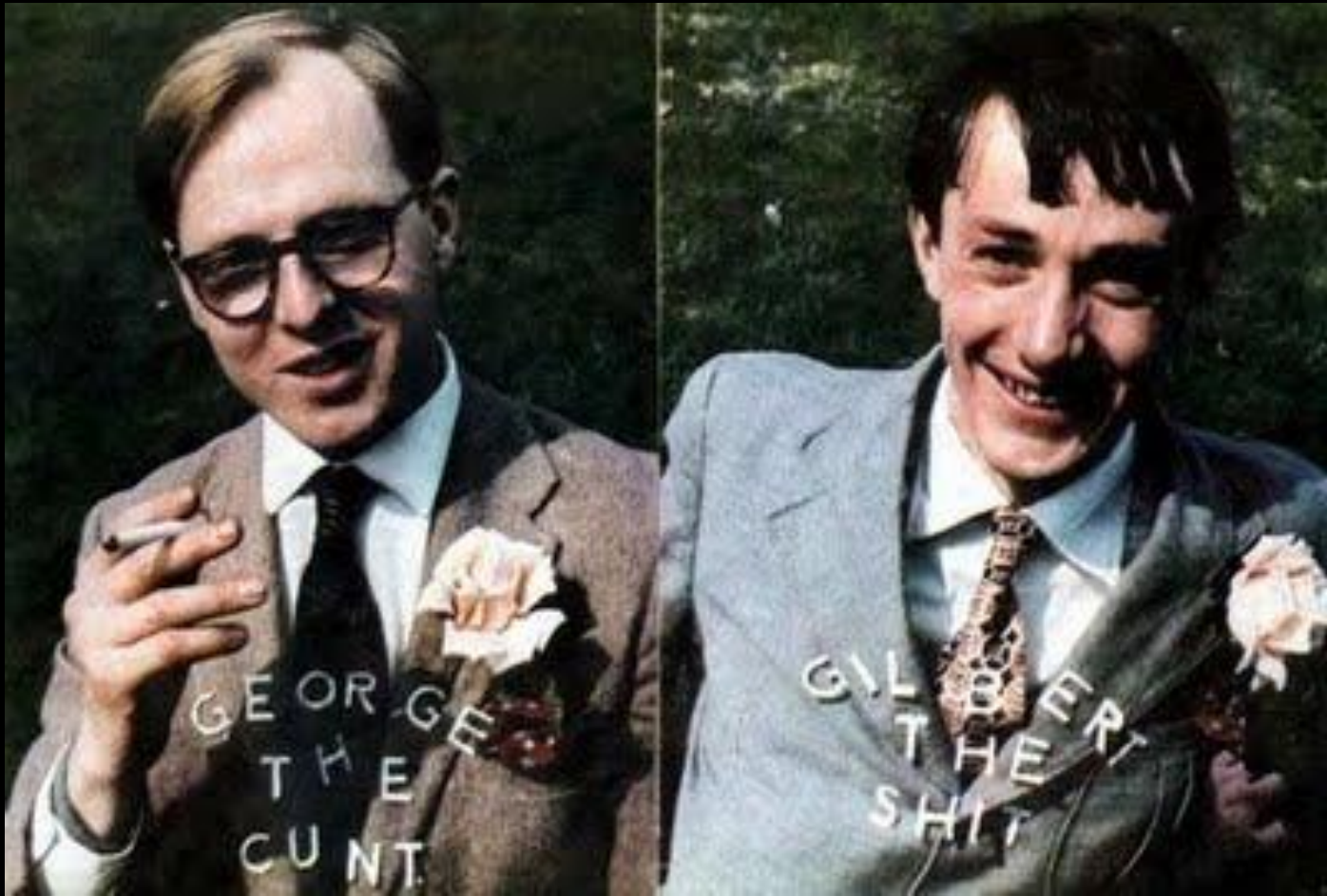
Gilbert and George, George the cunt, Gilbert the shit, 1969