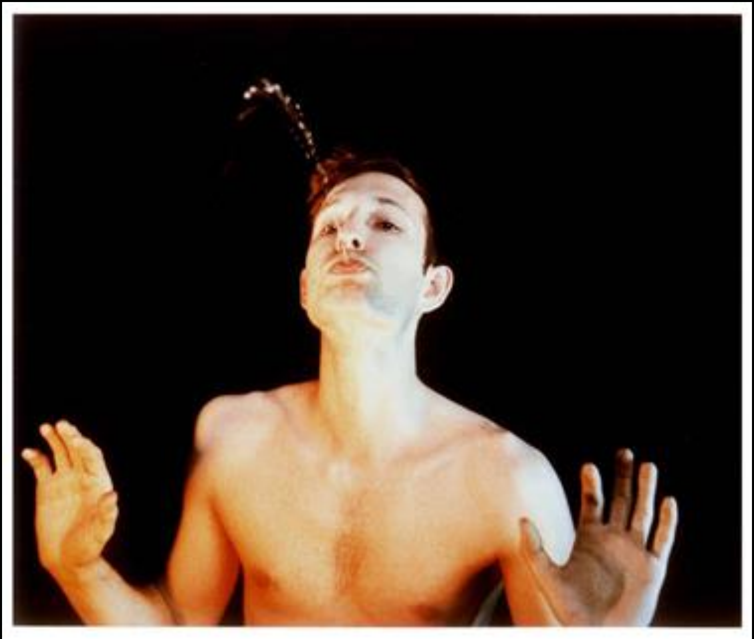
Bruce Nauman, Self-portrait as a Fountain , 1966-67