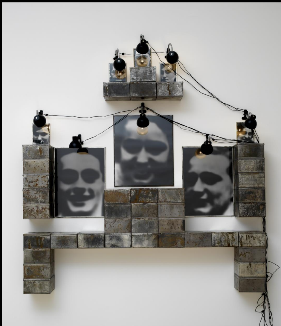
Christian Boltanski, Autel Lycée Chases , 1989