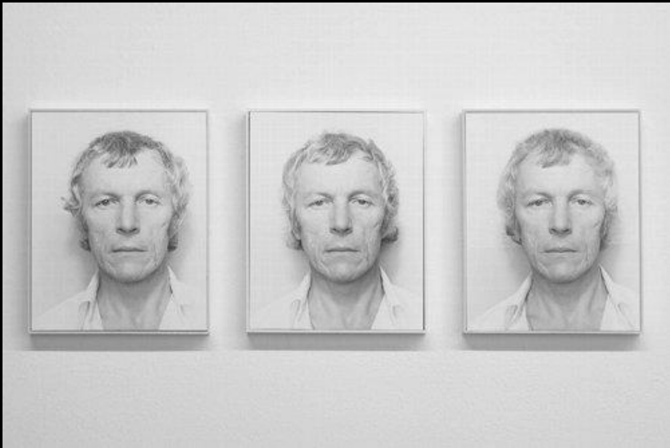
Roman Opalka, dal 1965