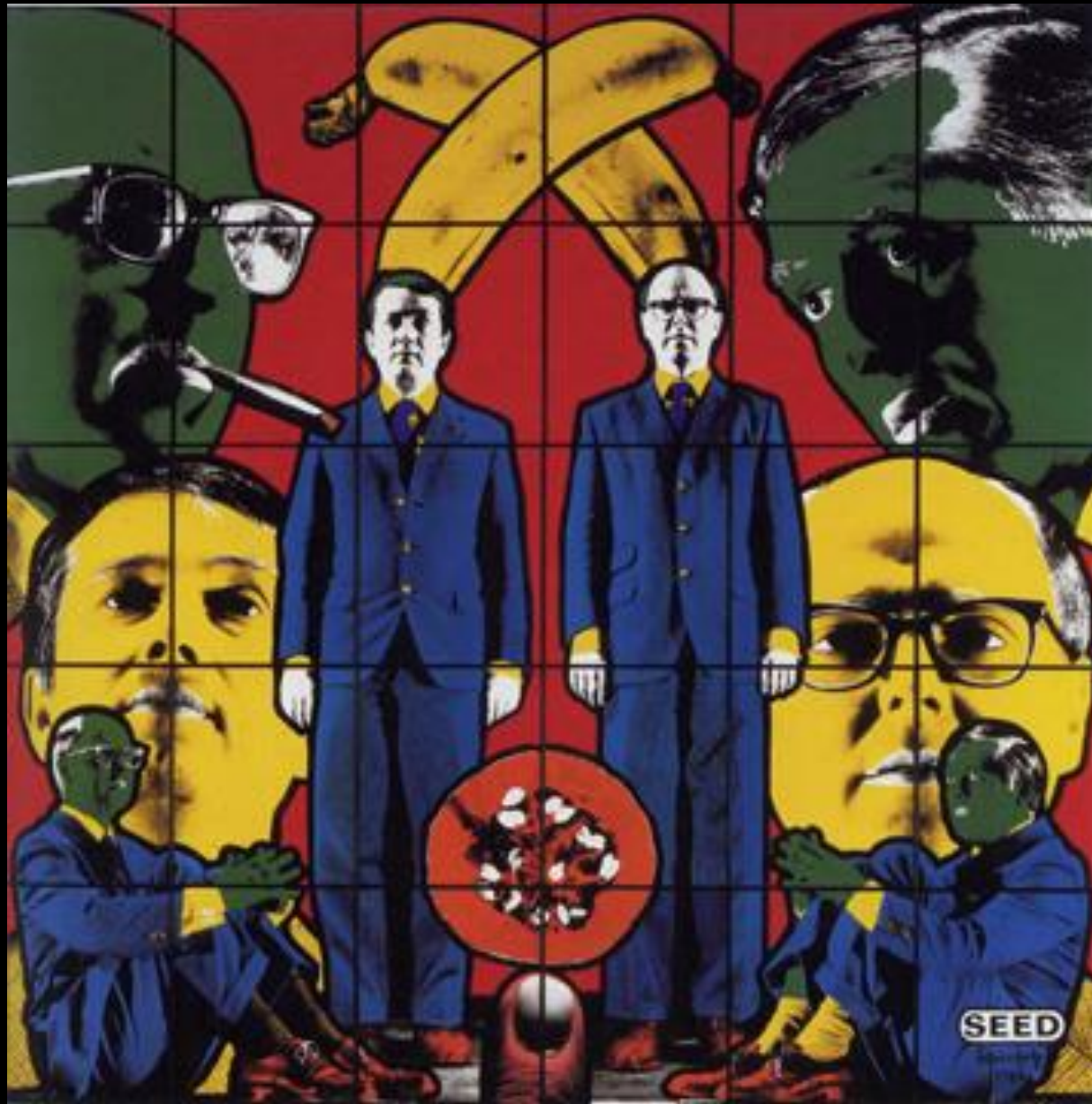
Gilbert & George, Seed , 1984