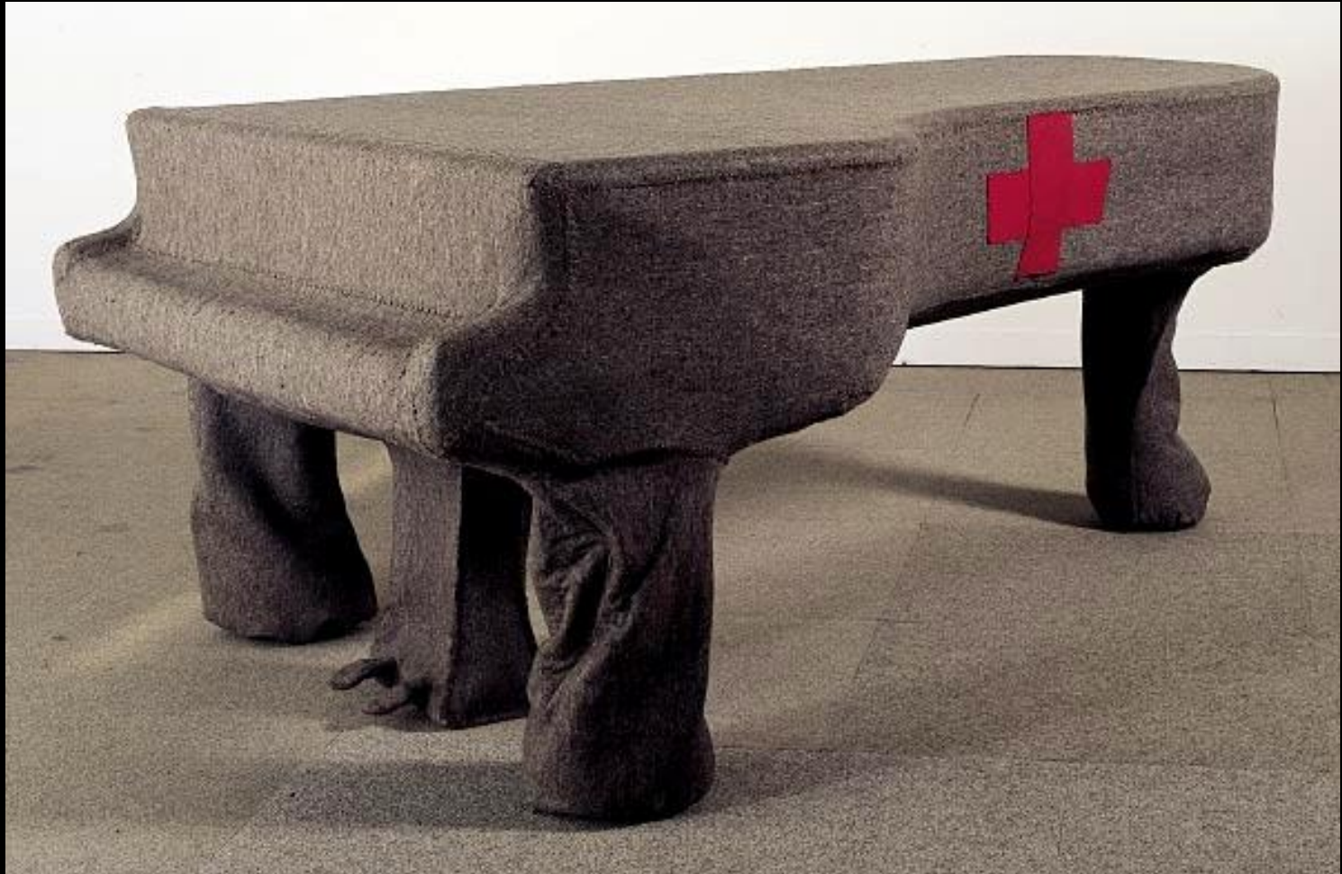
Joseph Beuys, Gallery 7 , 1966