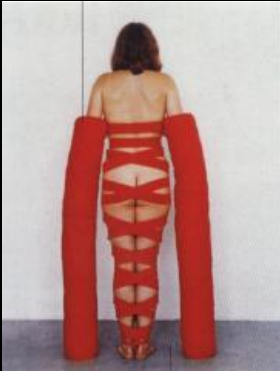
Rebecca Horn, Arm Extension , 1970