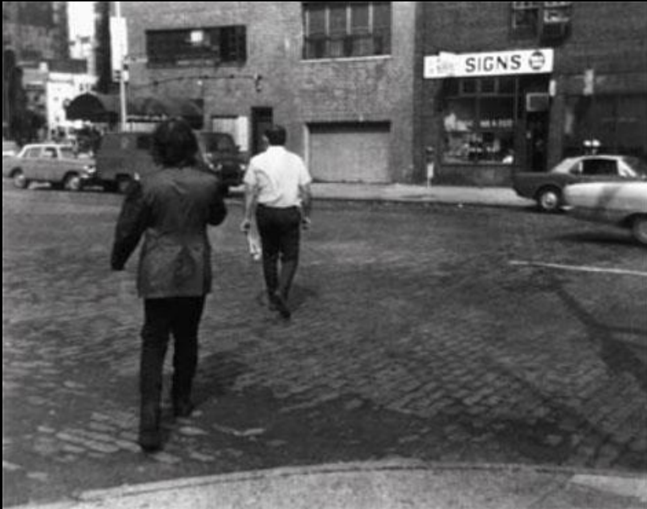
Vito Acconci, Following piece , 1969-1988